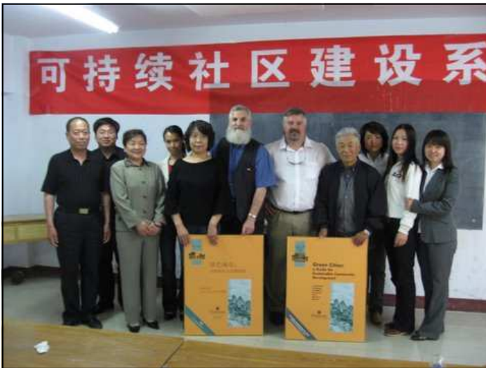
Project Team with community group

Our colleagues in China, Chinese and international, tell us this training is urgently needed to build civil society participation and the leadership skills to achieve socially and environmentally sustainable development.