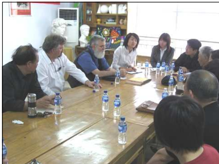
Project Team training with community

National Development and Reform Commission; and the Department of the Environment- National Development and Reform Commission, to expand the program's network and further inform Chinese leaders about program activities