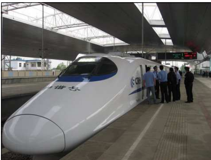
Bullet train "Harmony"